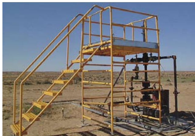
Custom builds available on request